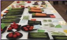
Llay Gardening Show – Bank Holiday Monday.

aggravated when no collections took place for most of last autumn." He expands, "As the service was not being delivered it was only right and proper that residents were not charged for this period. Rather than getting bogged down in issuing refunds, it was decided to extend the subscription by 6 months." Please get in touch if anyone has any problems with bin-related matters.