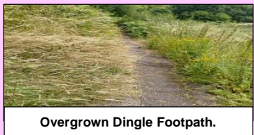
Overgrown Dingle Footpath.

of the governor is to support the staff and oversee that the school is run for the benefit of the children and the wider community."