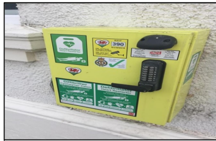
Llay Welfare Defibrillator – 1 of 3 in village.

The defibrillators were purchased by Llay Community Council back in March, 2020. Residents are urged to be aware as to which one of these is nearest to their homes just in case the worst were to happen.