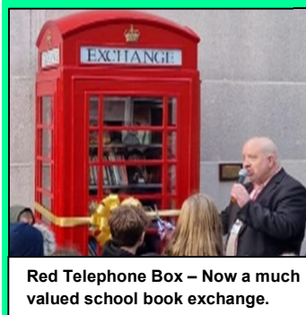
Red Telephone Box – Now a much valued school book exchange.