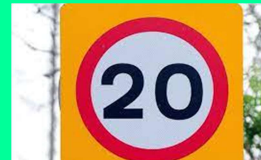
Reduction to 20mph.

More details of the Highway & Footway Safety Audit can be found on Page 2.